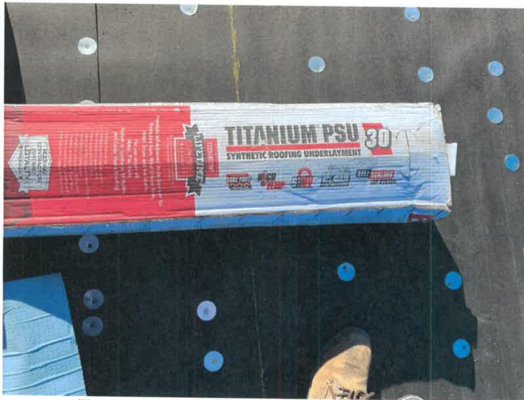
Figure 4 – Secondary Water Barrier at Sloped Section (Typical)