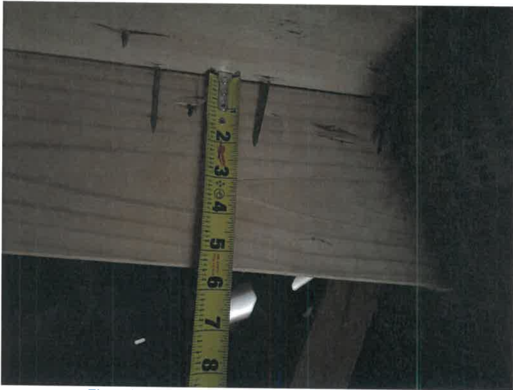
Figure 3 – Sheathing Fastener Size 8d Confirmed (Typical)