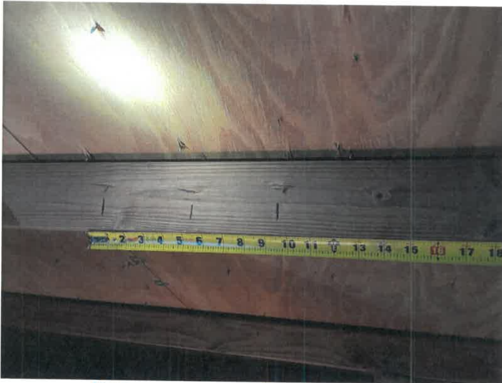
Figure 2 – Plywood Sheathing Fastener Spacing (Typical)